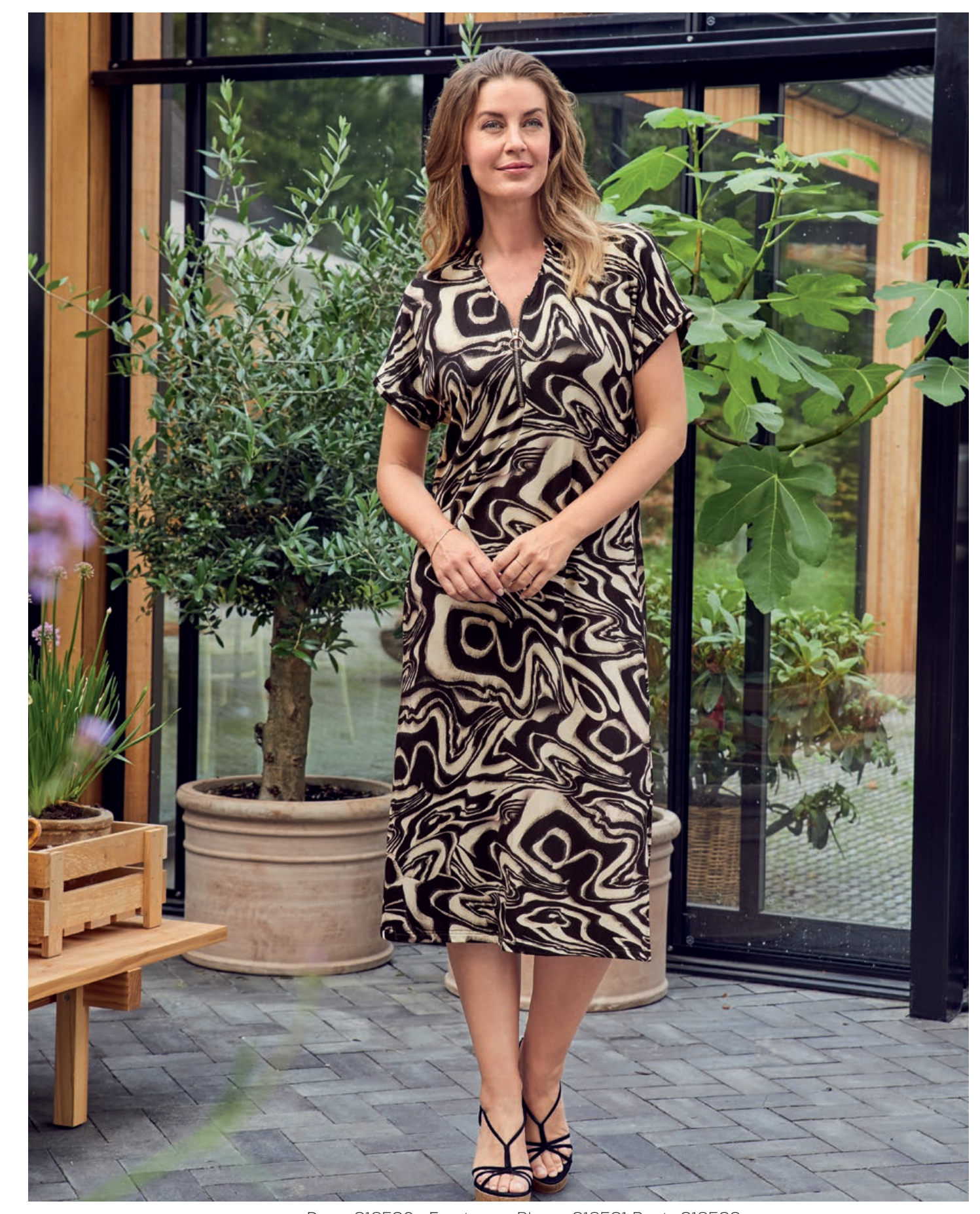
Dress 213590 • Frontpage: Blouse 213561 Pants 213566

For Summer 2022, Signature once again presents a stunning palette of beautiful colour combinations and outstanding prints.